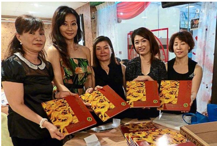
Down memory lane: Members of Penang Hokkien Kongsi showing the newly launched book during the kongsi's 158th anniversary at CRC Restaurant, George Town.